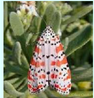
Bella moth