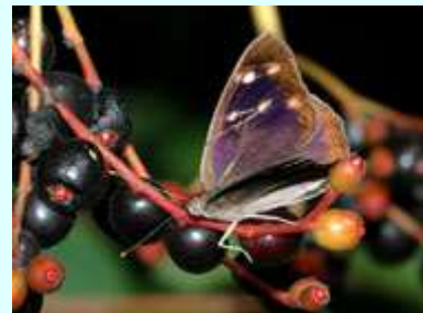
Dingy Purplewing Castellow Hammock, 2006

Join NABA and the Miami Blue Chapter; membership information is at: www.miamiblue.org .