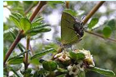
Amethyst Hairstreak Castellow Hammock, 2004