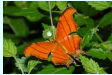
Ruddy Daggerwing Castellow Hammock, 2007

A D Barnes recently added a butterfly garden/walk to the northwest corner of the park. Take a stroll along it when you visit Native Plant Day.