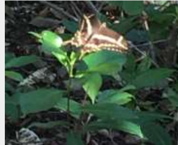
Schaus' Swallowtail North Key Largo April 12, 2019