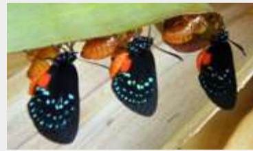
Atalas being counted

The Shark Valley count covers the north entrance