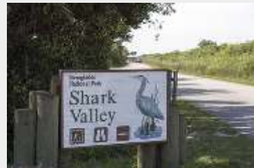
Shark Valley entrance