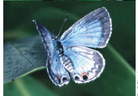
University of Florida