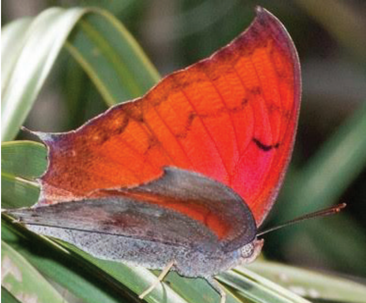
University of Florida