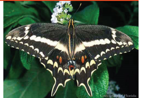
University of Florida

A portion of the proceeds to benefit the National Butterfly Center in Mission, Texas and FOLK