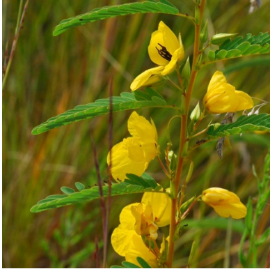
Chamaecrista fasciculata partridge pea