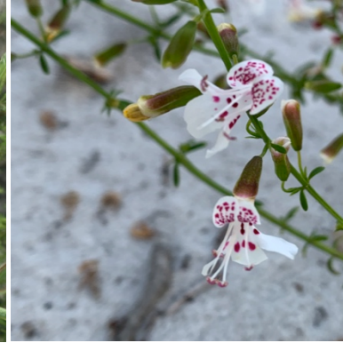
Dicerandra frutescens scrub balm, Lloyd's mint