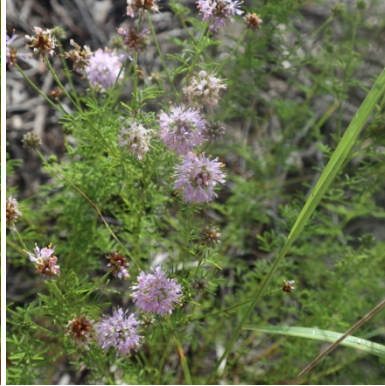
Dalea feayi Feay's prairieclover