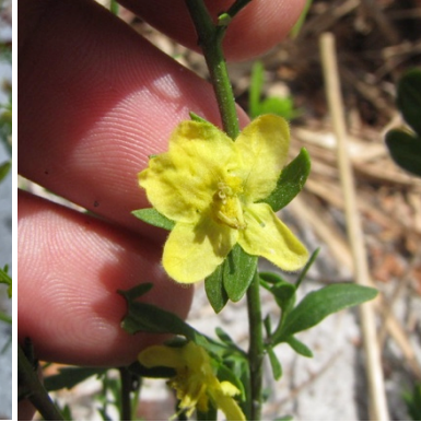
Seymeria pectinata piedmont blacksenna