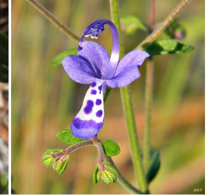
Trichostema dichotomum forked bluecurls